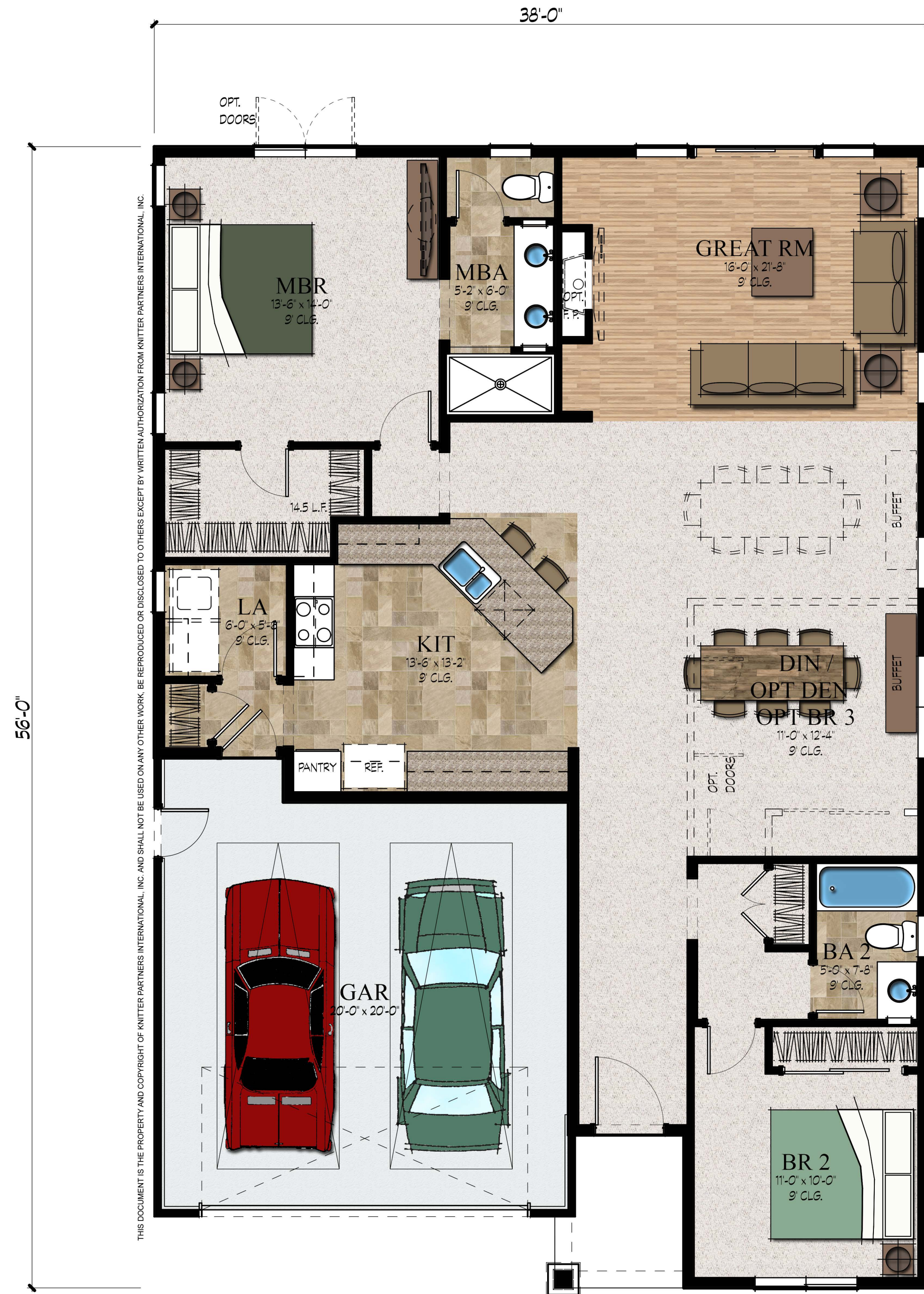
3 FIRST FLOOR