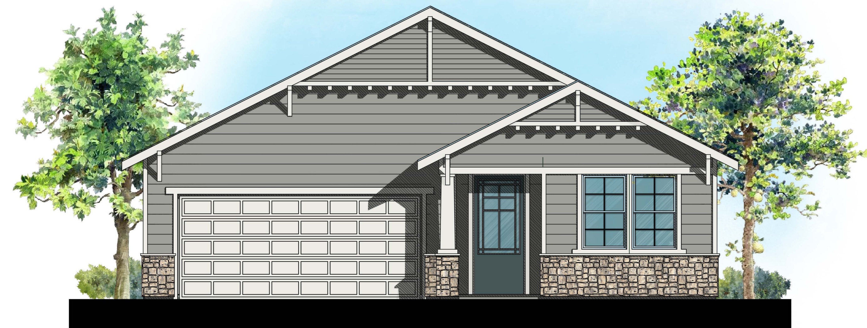
2 FRONT ELEVATION