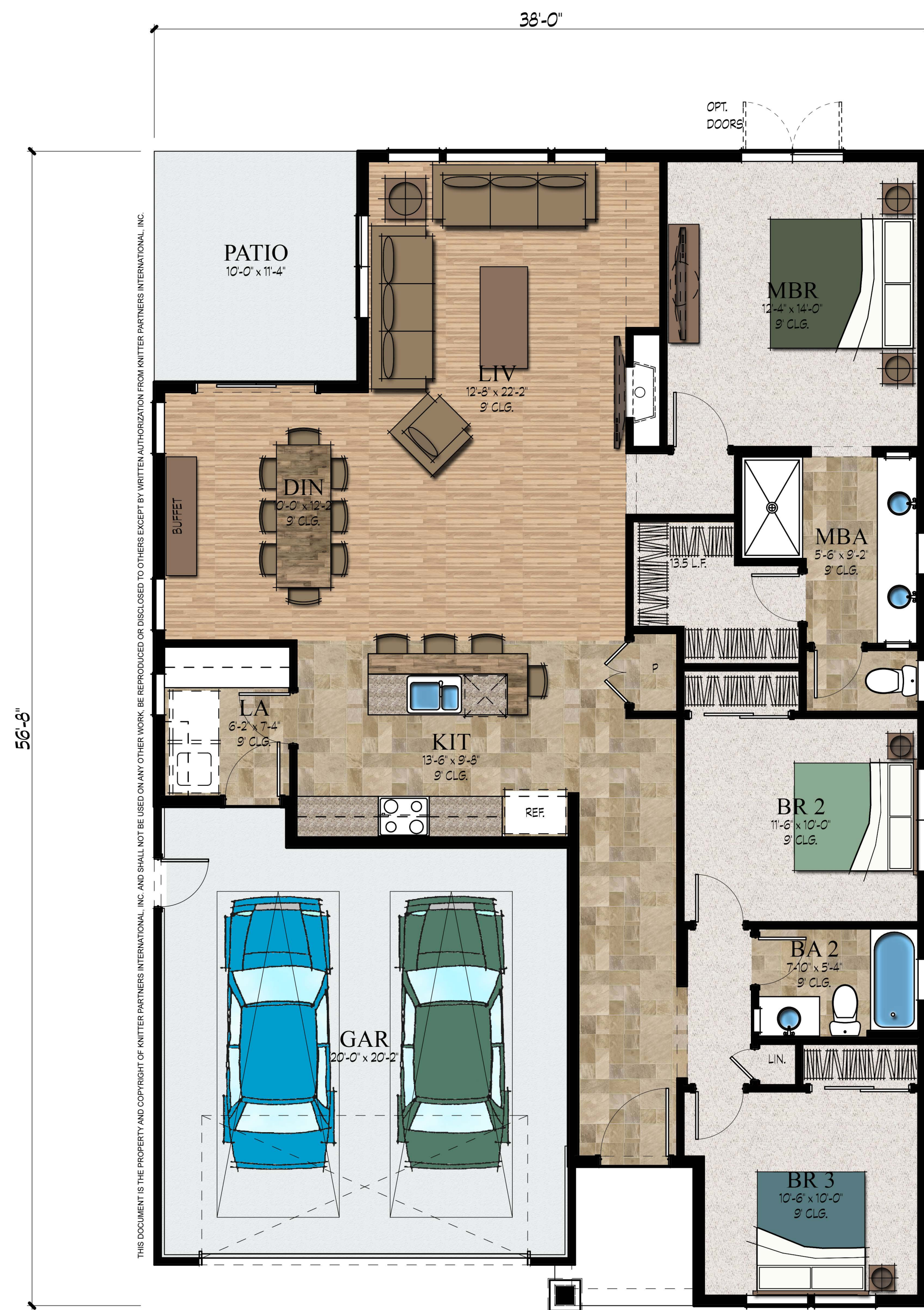
2 FIRST FLOOR