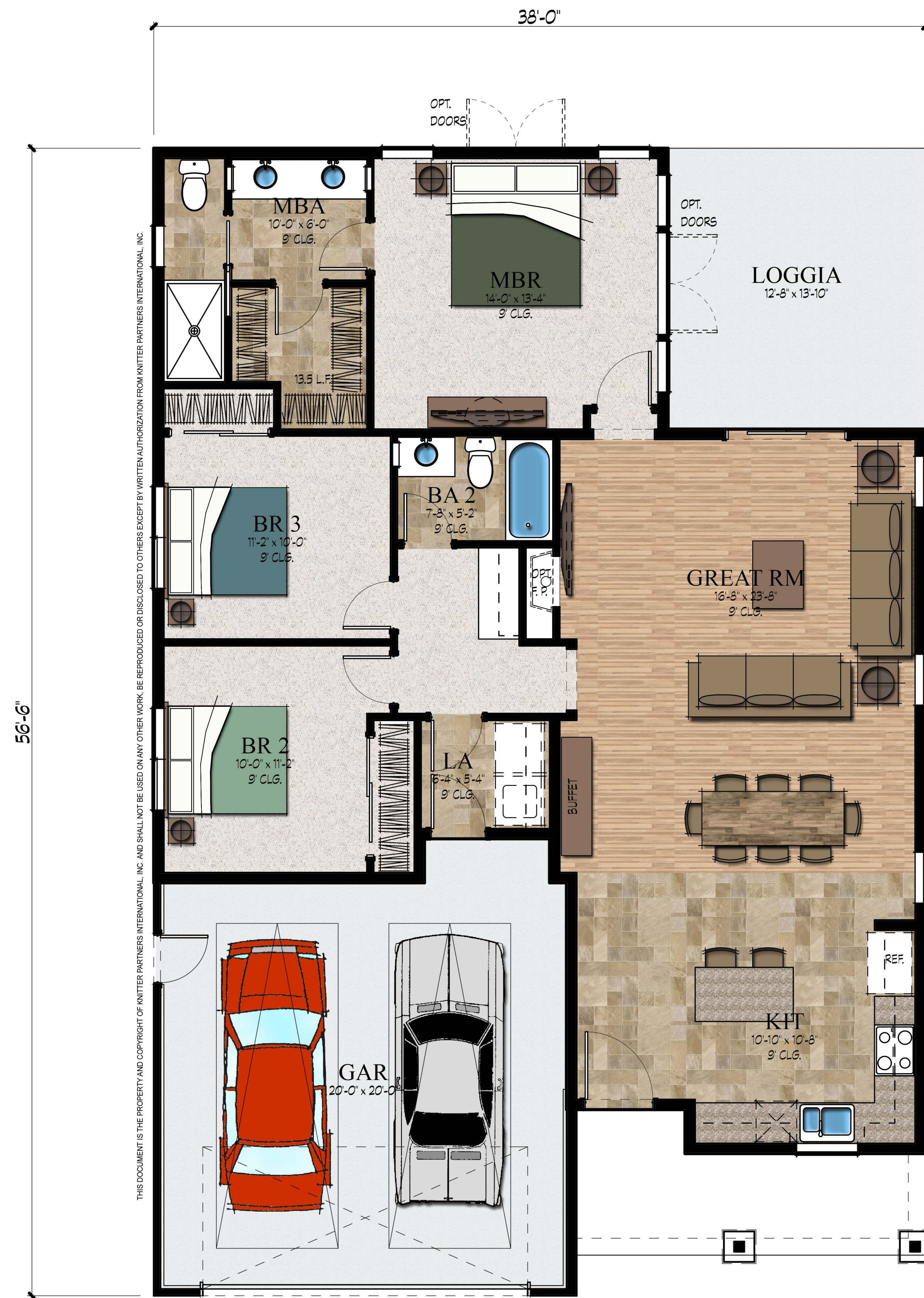
1 FIRST FLOOR 1,409 sq ft