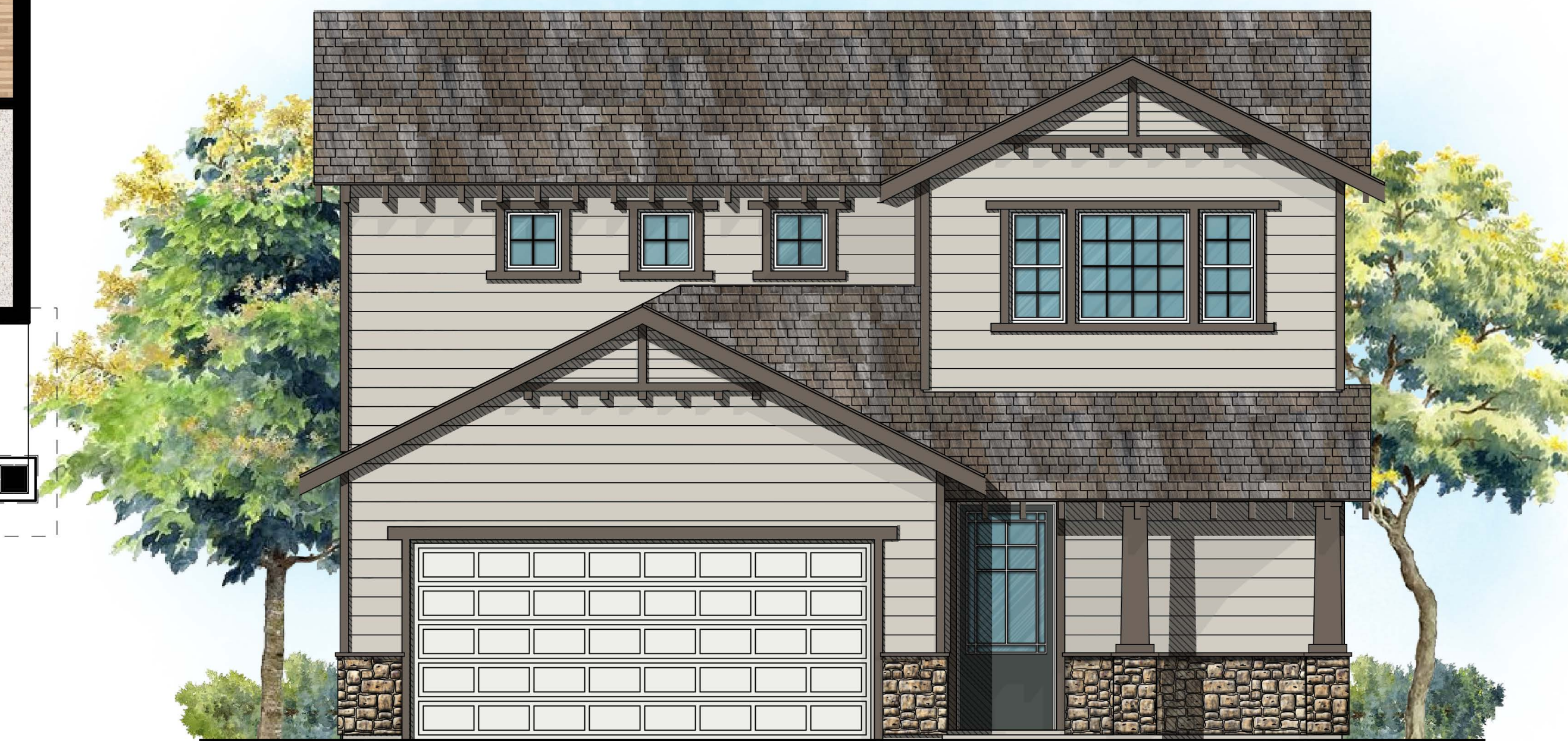
3 FRONT ELEVATION