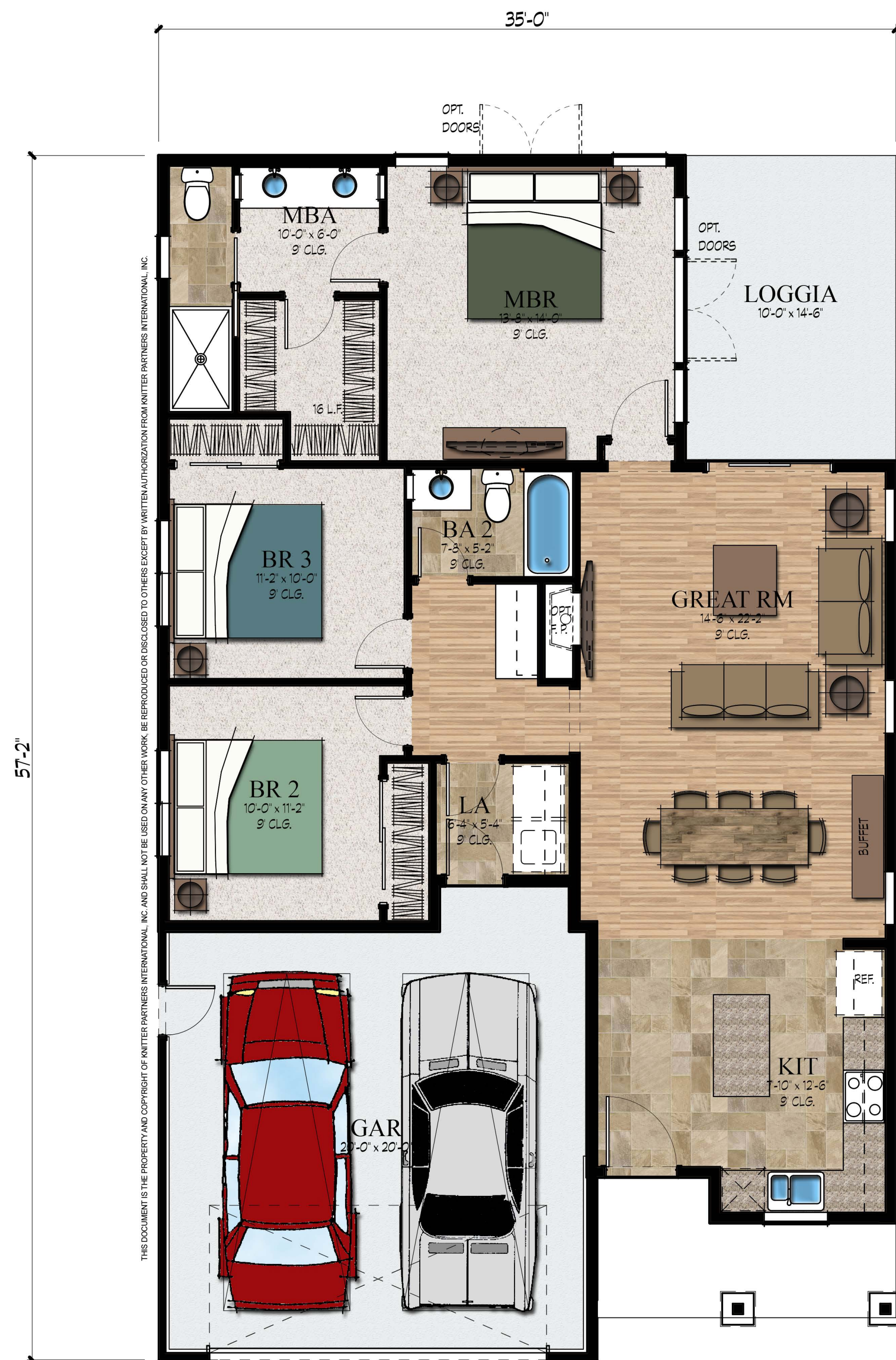
1 FIRST FLOOR 1,321 sq ft